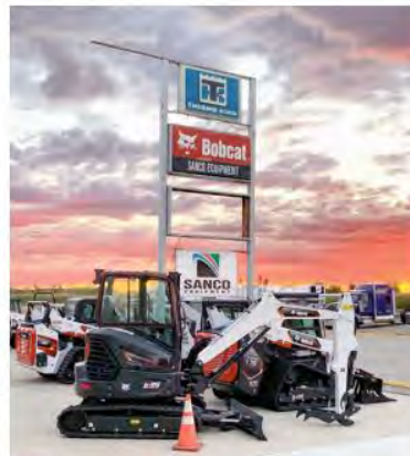
Sanco's equipment division was formed in 2003 when the family bought an existing Bobcat dealership in Albert Lea, Minn.